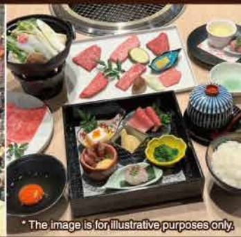
* The image is for illustrative purposes only.